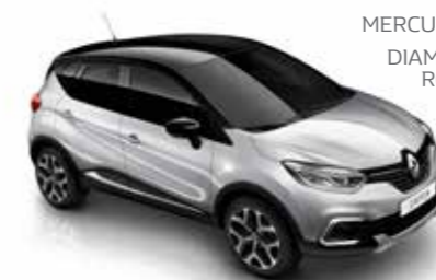
MERCURY SILVER (MP) DIAMOND BLACK ROOF(MP)