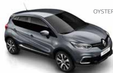
OYSTER GREY (MP)