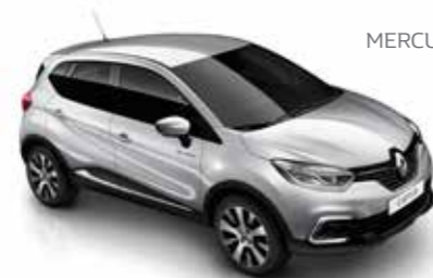
MERCURY SILVER (MP)