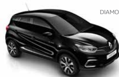
DIAMOND BLACK (MP)