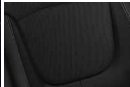
Dark Carbon fabric upholstery