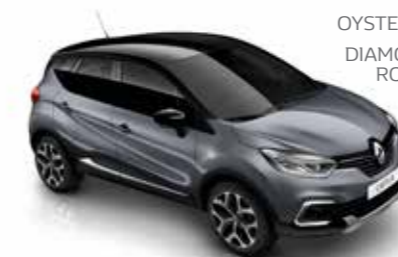
OYSTER GREY (MP) DIAMOND BLACK ROOF(MP)