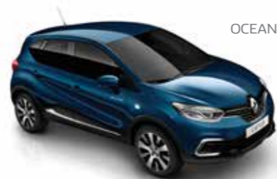
OCEAN BLUE (MP)

NM: Clearcoat Opaque; MP: Metallic Paint