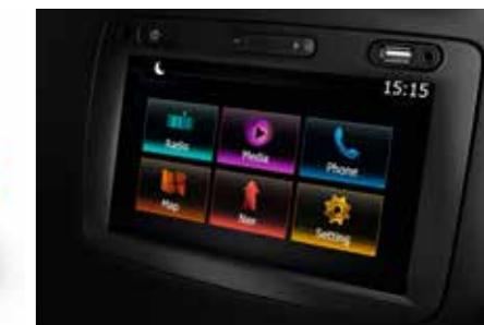
MediaNav® multimedia system