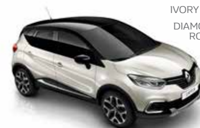
IVORY WHITE (NM) DIAMOND BLACK ROOF(MP)