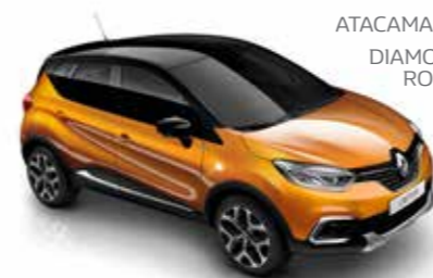
ATACAMA ORANGE (MP) DIAMOND BLACK ROOF(MP)