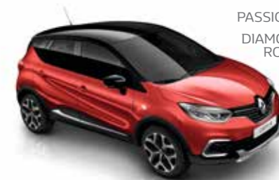
PASSION RED (MP) DIAMOND BLACK ROOF(MP)