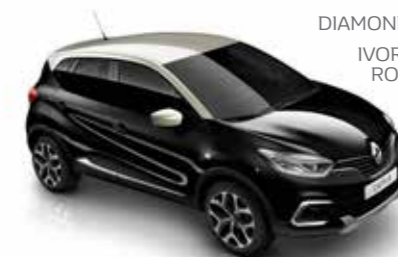
DIAMOND BLACK (MP) IVORY WHITE ROOF(NM)

Note: Printing limitations do not permit subtle paint shades to be shown with complete accuracy.