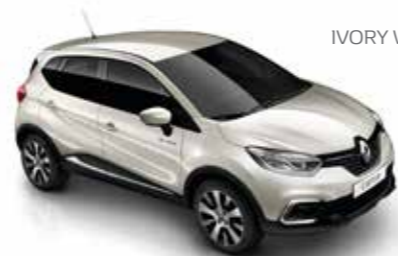
IVORY WHITE (NM)