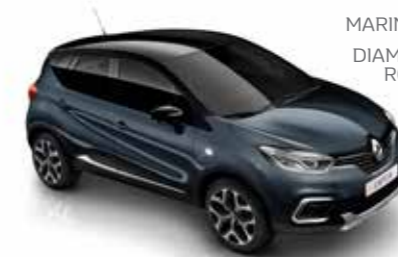
MARINE BLUE(NM) DIAMOND BLACK ROOF(MP)