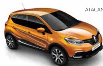
ATACAMA ORANGE (MP)