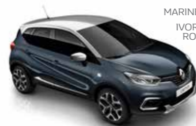
MARINE BLUE (NM) IVORY WHITE ROOF(NM)