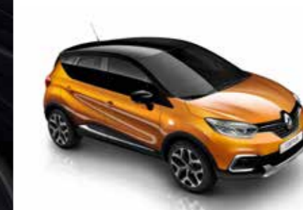
Bi-tone roof and mirror shells